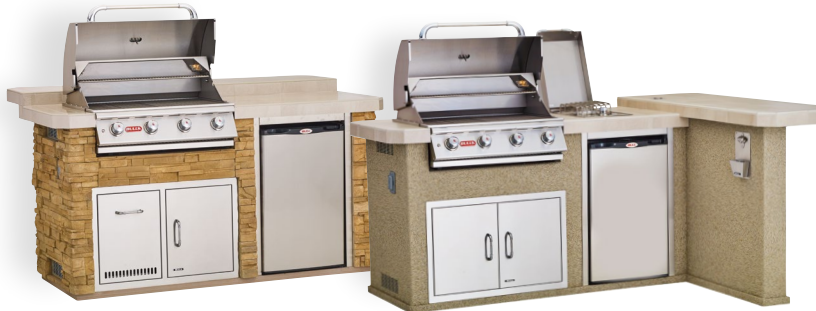
POWER Q™ Raised Bar