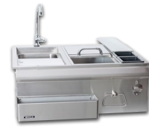
30" BAR CENTER