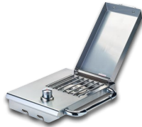
SIDEKICK GRILL CART SIDE BURNER