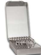
SINGLE SIDE BURNER