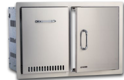
DOOR/PROPANE DRAWER COMBO