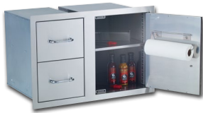
DOOR/DRAWER COMBO, W/ PANTRY INSERT