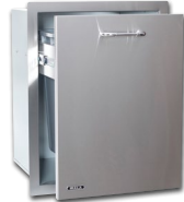
PULL OUT TRASH DRAWER