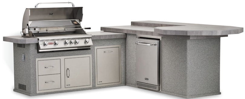
SUPREME Q™ Raised Bar