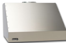
VENT HOOD - TWIN FAN