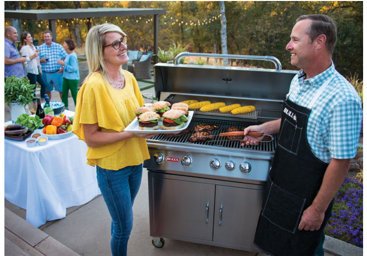
Bull Grill Carts are very convenient, grill and entertain for the gang and roll your cart out of the way when your are finished grilling.

The brand Choice for Professionals and Homeowners, Bull Premium BBQ Grills are lauded by Chefs and backyard enthusiast throughout the world for their performance, construction, and design. All Bull gas grills come complete with our proprietary ReliaBull Even Heat Technology, single piece dual lined hoods, solid stainless steel cooking grates, and individual friction based piezo igniters. Because a Bull is built to last a lifetime all grills are designed to be easily installed into one of our Outdoor Kitchens for a hassle free backyard upgrade. Bull's superiority in the Grill industry is demonstrated each year as the official grill of the largest food sport competition, the World Food Championships.