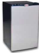
REFRIGERATOR 4.5 cu. ft.