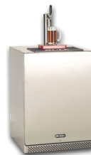
BULL KEGERATOR 6.6 cu. ft. Outdoor Rated