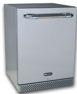
PREMIUM REFRIGERATOR 4.9 cu. ft. Outdoor Rated