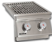
SLIDE-IN DOUBLE SIDE BURNER