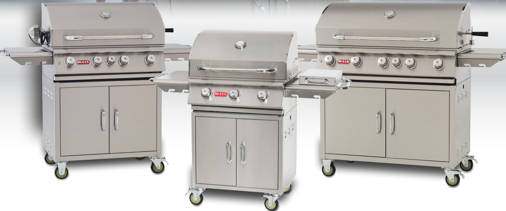
ANGUS™ GRILL CART