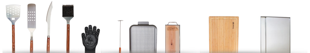
Grill Brush, Spatula, Tongs, Knife, Pit Mitt

With more than 80 unique grilling accessories, available in high-quality wood and/or stainless steel, Bull accessories will help turn you into a grilling master. Bull offers barbecue tools, grilling utensils, kebob skewers, thermometers, smoking and seasonings tools and more!